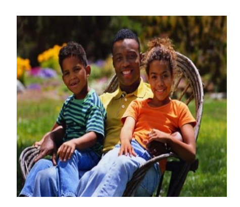
EMPLOYEE BENEFIT SPECIALIST HELPING THE AMERICAN FAMILY