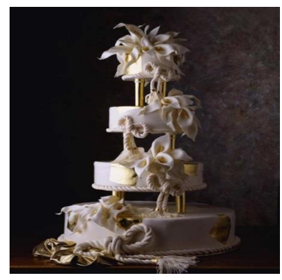
45% OF MARRIAGES END IN DIVORCE (THE GOOD NEWS IS THE DIVORCE WAS 50% – Now It's Down 5%)